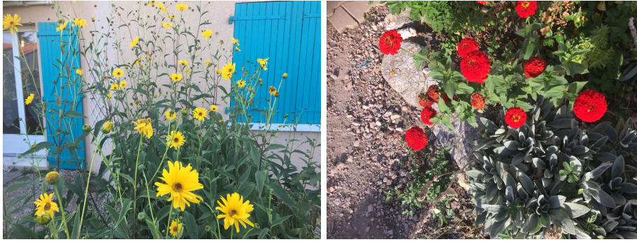
Figure 1: samples of images for the two classes of flowers that should be classified.